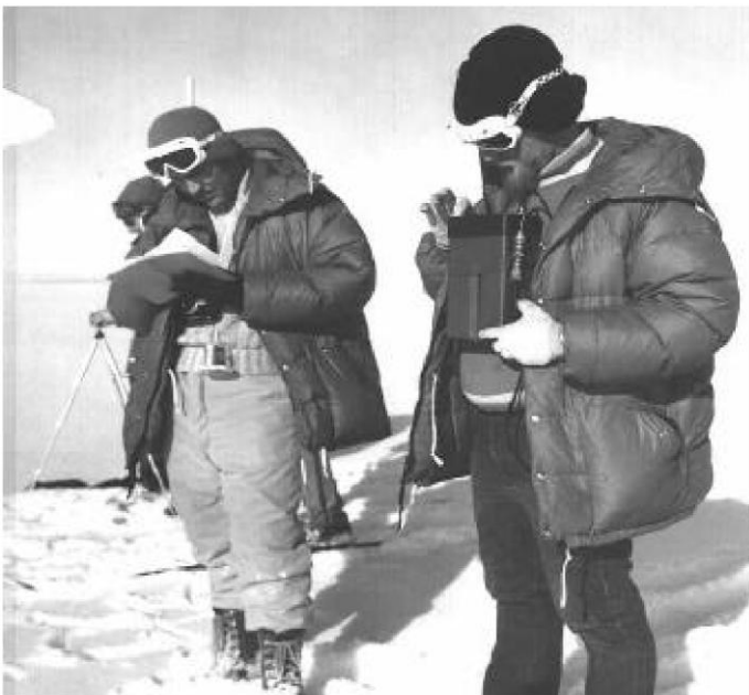
G-856AX Arctic Survey

The G-856 provides a reliable, low cost solution for a variety of magnetic search and mapping applications. Single key stroke operation means the G-856AX can be operated by non-technical field personnel or used in teaching environments. The G-856AX uses the established proton precession method, allowing accurate measurements to be made with virtually no dependence upon variables such as sensor orientation, temperature, or location. The