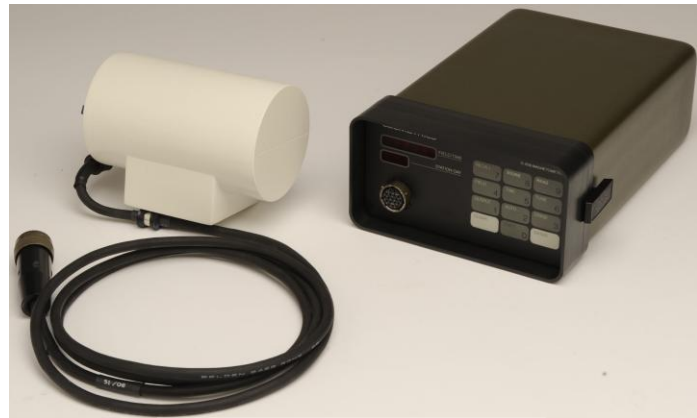
G-856 Console and Sensor

unit provides a repeatable absolute total field magnetic reading, traceable to the National Bureau of Standards, unlike other magnetic field measurement processes which measure only a single component of the field.