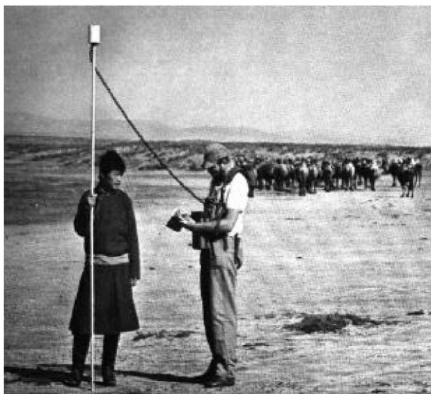
G-856AX Desert Survey in Tibet

A thoroughly well proven design (over 2,600 units sold), excellent performance and the lowest price professional system are key features of the G-856AX. Combined with the ease of use, user friendly download/editing software, and readily available commercial contouring programs, the G-856AX represents a complete magnetic surveying package generating high quality data for budget conscious users.